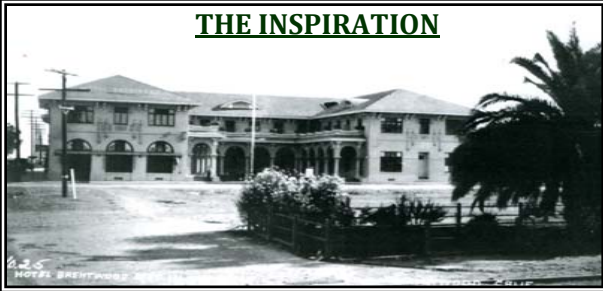
The Brentwood Hotel, circa 1913

The Civic Center draws its inspiration from the old Brentwood Hotel, which was located at the corner of Oak and First Streets. The hotel was designed and built by Irving Gill in 1913. It had 40 rooms and two courtyards beautifully arranged for the pleasure and comfort of its guests. The outdoor pergolas and lawns were kept neatly manicured and guests could often be seen taking tea there on a Sunday afternoon.